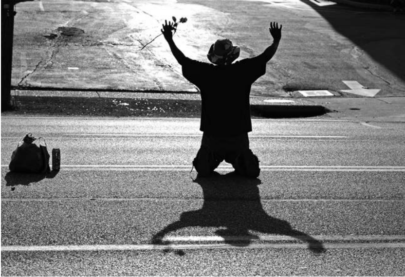
FIGURE 6. A Black man kneels in the street in Ferguson, Missouri, during a protest over the killing of Michael Brown, an unarmed Black teenager. August 24, 2014.