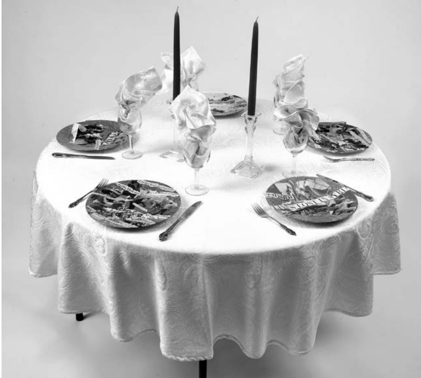
FIGURE 1. Helen Zughaib, “Eat the News,” installation including ceramic dinner plates, enamel and newspaper collage, table, glassware, napkins, silverware, candlesticks, 2016.

isolates a tragic event for consumption. The threshold is rhetorical and situational, and therefore it is indistinguishable from the conditions of its emergence and consumption. The threshold’s convenient suspension of these histories and conditions obfuscates its violent genealogies and, more broadly, the ethical failures of humanitarian politics. “Eat the News” does not seek humanitarian recognition from or identification with distant audiences but rather prompts critical consideration of public consumptive participation and complicity in the humanitarian paradox and its grounding in violent exceptions.