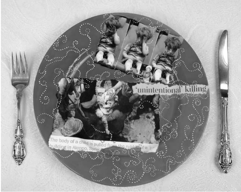
FIGURE 2. Detail, ceramic plate with enamel and newspaper collage. From Helen Zughaib, “Eat the News,” 2016.

from acting at a distance to actual intervention” (70). These determinations, however, are not drawn solely by state actors or sovereign powers but “may be drawn and redrawn by many social actors” (73). The humanitarian threshold mobilizes vulnerability and liminality and in this regard operates as a form of biopolitics engaged in the determination of which forms of life are deemed socially valuable and which are not—a determination that “Eat the News” effectively elucidates in drawing attention to images that are widely circulated and the narratives that accompany them. For example, the “unintentional killing” headline on the close-up of one of the five plates (see figure 2) draws attention to the broader collateral-damage narrative that governments mobilize to characterize violence that impacts women and children or to legitimize humanitarian interventions.