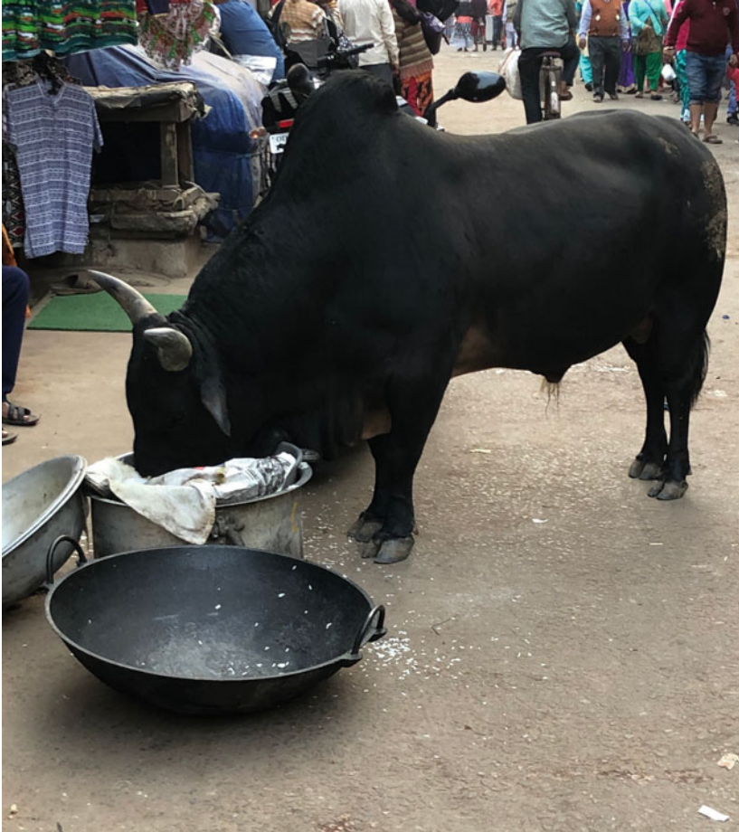
Fig. 5.1 A street-wandering ox in Puri is given a full pot of rice by a shopkeeper

seen in the previous chapter, in India such conditions have become the exception. And yet, the fact that cows are seen freely roaming the streets of village, town, and urban areas is a striking indicator of how human-animal society could be imagined if these cows would be properly cared for (see Fig. 5.1). 42