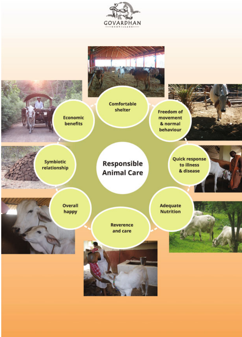
Fig. 7.1 Govardhan Eco Village Responsible Animal Care brochure indicates cow care as care affirmation (Used with permission of Govardhan Eco Village [Thane, Maharashtra, India], all rights reserved)