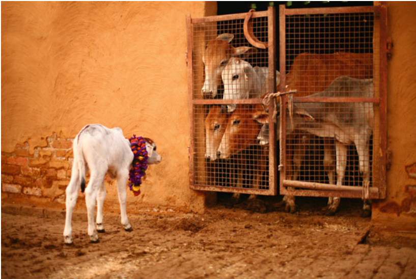
Fig. 7.2 Week-old Balaram (same calf as on front cover) is examined by his bovine seniors at Care For Cows goshala, Vrindavan