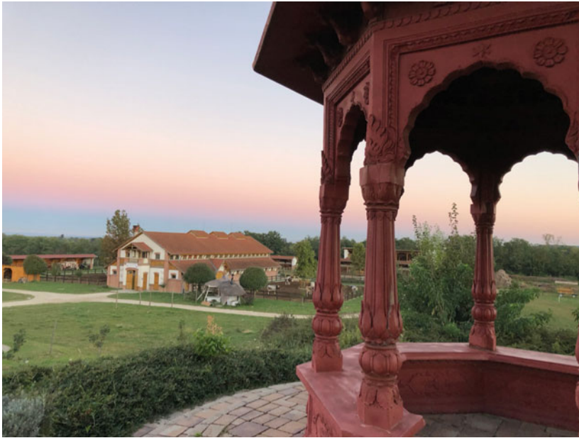
Fig. 6.2 The New Vraja Dhama goshala aims to showcase cow care for increasing numbers of visitors

New Vraja Dhama is also affiliated with ISKCON, about which we have already discussed in Chapter 3 with respect to the mission’s founder, Bhaktivedanta Swami Prabhupada. NVD is a highly structured community, with some fifty organizational departments, each closely monitored for numerical sustainability indexes. 11 The cows and agriculture departments in particular watch very closely their productivity, as the aim is to eventually come to the point where sustainability and self-sufficiency