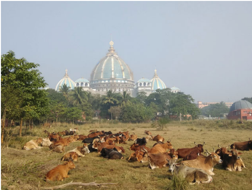
Fig. 6.1 Mayapur goshala cows ruminate in a field before the (under construction) Temple of the Vedic Planetarium

Reinforcing this concern would appear to be Mayapur Chandrodaya's current managerial priorities. As Mayapur Chandrodaya Mandir anticipates a major influx of visitors, the main source of attraction for them will be the massive TOVP. As a multi-million-dollar construction project, understandably, almost all fund-raising attention goes toward temple construction, leaving the goshala as a lesser priority for the MCM management team. Despite the reasonable justification that the end result will be much greater attention to the goshala, there lurks—for this observer—a sense of irony in the juxtaposition of this globalizing construction project, dubbed by another observer as “a colossal monument to hybridity” (Fahy 2018, p. 15) with the project's goshala (see Fig. 6.1). Practically in the temple structure's massive shadow, the cows may appear like mere tokens of the world of “plain living and high thinking” that Prabhupada so much emphasized as the aim of the project to showcase.