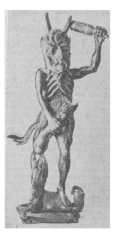
Fig. 4: The Hell Debate became a frequent topic in Norwegian newspapers in 1953, and the discussion also included poems and artistic illustrations. This illustration of Mephisto was printed in Dagbladet 5. February 1953.