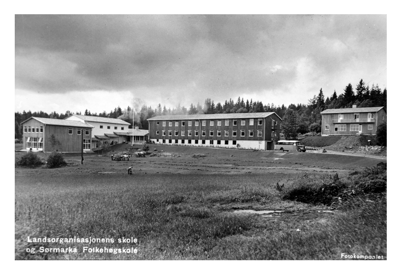
Fig. 8: The Labour movement's folk high school at Sørmarka.

school subject, and this subject included social economics, economic geography, and social legislation, as well as knowledge of the government apparatus. The students were also educated in the Norwegian language, history, science, accounting and bookkeeping, drawing, and singing. Yet, the pedagogical methods were more important than the school subjects. In pedagogical matter, the school was inspired by contemporary reform pedagogy, and it became important that the students should be qualified in practical and useful working methods. The students should also be trained to be reflective individuals who could form their own opinions. Thus, the folk high school at Sørmarka came to strengthen the student's knowledge on politics rather than its ideological dimension. Sørmarka Folk high school was run until 1955.