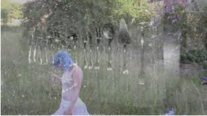
Figure 4. Deadly Landscapes. Still from The Luminol Reels .