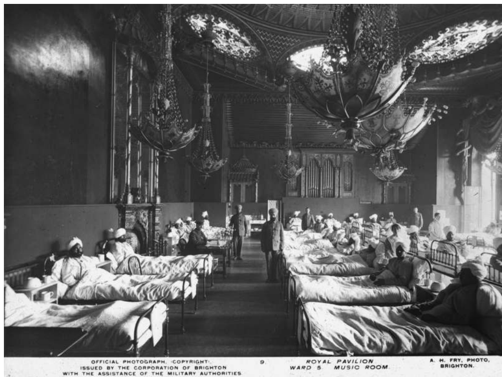
Figure 2.1 Magic lantern slide showing Indian soldiers in beds in the Music Room of the Royal Pavilion during its use as a military hospital, 1915.

designs down into the room. Here we can get an idea of how the men reflected in the chandeliers and mirrors of Borden's casino may have looked. The monochrome of the image is only able to reveal the contrast between the white of the sheets, the patients' clothes and their turbans, and the grey of the rest of the room, when in reality the room is brightly decorated with bold reds, oranges, and gold.