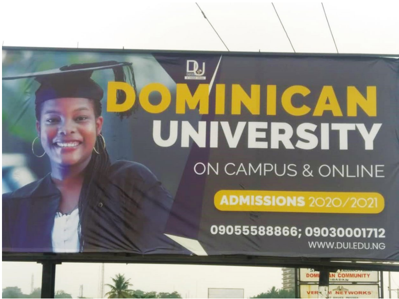
Figure 7.2 A university in Nigeria announces on-campus and online admission due to COVID-19 pandemic