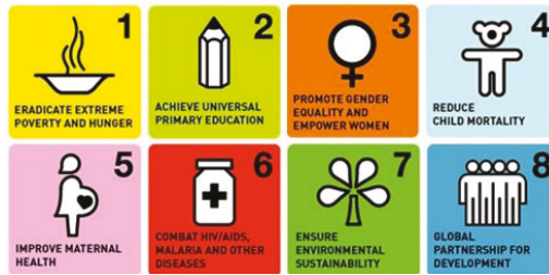
Figure 1. The eight MDGs contained in the UN Secretary-General's Road Map report of September 2001 [2].