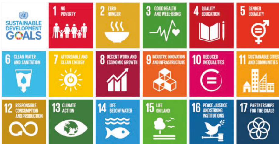
Figure 2. The 17 SDGs outlined in pages 14–27 of the UN resolution on the post-2015 SDG agenda [1].

The question I will seek to address in this article for Laws' Special Issue on Disability and Human Rights , however, is whether the 17 SDGs are as “bold and transformative” ([1], p. 1, preamble), if not adequately sufficient, to provide seminal instruction for the de facto advance of the human rights of persons with disabilities in the unfolding twenty-first century. My views in response to this question are based on having worked as part of a right to health research collaborative for the last three years, tasked with empirically monitoring and providing advice to the European Commission on health's location in the unfolding post-2015 SDGs [3–5]. These views are further grounded in my recent, parallel experience in both disability research and rights advocacy [6–10].