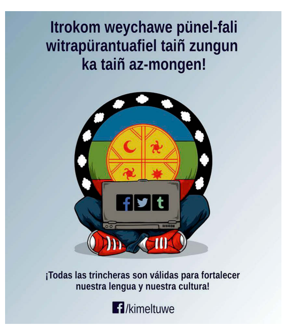
Figure 3. Kimeltuwe. 2016. "Küme antü rulpayaymün, kom pu che!"

Facebook, January 25, 2016. https://www.facebook.com/kimel tuwe. Screenshot by the author, taken January 25, 2016.