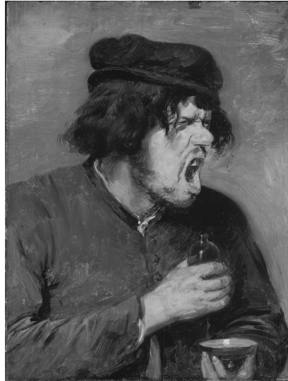
Figure 5. The Bitter Potion (c.1636–8), by Adriaen Brouwer; Städel Museum, Germany. The man's face is contorted in an expression of revulsion after tasting the bitter medicine; his grimace resembles the appearance of a person in pain.

up to expel the bad humours by vomiting—the feeling was nevertheless a deeply unpleasant one. 45 John Collinges (1623–91), an Essex clergyman, averred that ‘there is nothing more . . . troublesome[e] to us [in sickness], than the sower recoilings of our stomach’. 46 Terms that occur frequently in patients’ descriptions of nausea include ‘disgustful’, ‘loathing’, and ‘distasteful’, all of which suggest a sensation of deep repugnance towards edible substances. 47 This aversion was fundamentally sensory in nature: it was the texture, taste, and smell of a foodstuff or medicine that elicited these feelings. Speaking of texture, the sixteenth-century Suffolk surgeon Philip Barrough warned that ‘those things that require much chewing, do cause unpleasantnesse’ to the sick, while the London physician Thomas Moffet (1553–1604) observed that ‘Weak stomachs . . . eschue’ food of a slimy nature, such as ‘fat, oily, and buttered meats’. 48 Purgative physic was obviously disgusting, since it was the ‘loathsome savour’ that provoked vomiting, but even ostensibly pleasant foods and medicines were found to taste and smell nasty. 49 This tendency was attributed to patients’ inability to ‘distinguish the true taste of any