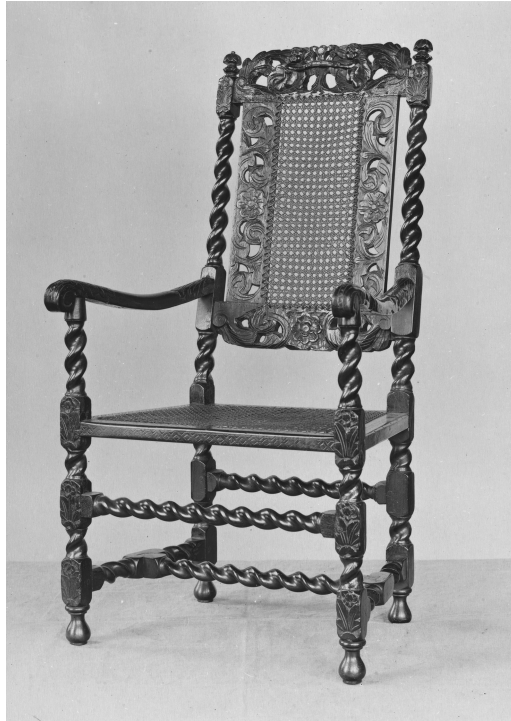
Figure 8. Armchair with floral scrollwork, c.1685; Armchairs rose in popularity in the 1600s; the use of cane for the back and seat is an innovation from Asia. With a high back, and long arms, this chair would have provided good support for the sitter's shoulders and back, an essential requirement for the weak convalescent. A cushion would have been placed on the seat for comfort.