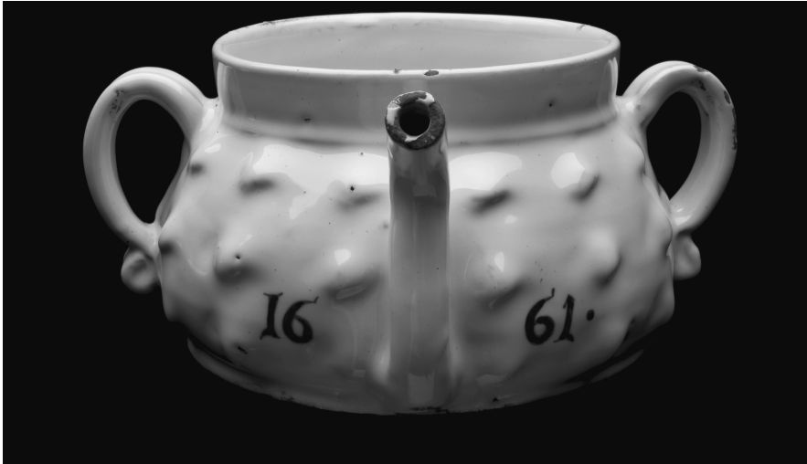
Figure 3. Posset cup, 1650–1700; Science Museum, Wellcome Images, reference: L0057146 (CC BY 4.0). Posset was a thick liquid food, commonly taken by convalescents and other ‘weak stomached’ patients; typically it was made from warm milk, curdled with ale/wine, and flavoured with sugar and spices. This pot is decorated with raised bumps, a technique known as repoussé. The bumpy texture, together with the handles, may have helped the weak convalescent to grip the pot; the spout facilitated drinking.

Another important consideration was liking. At the beginning of convalescence, it was vital to indulge the patient’s dietary predilections. The Manchester physician Thomas Cogan (c.1545–1607) provided a justification in his regimen for sickly students: