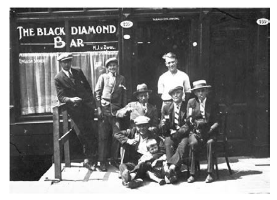
Figure 5.3 Photograph of The Black Diamond Bar on the Schiedamsedijk, presumably during the 1930s (exact date and creator unknown).

discerned on bars' front windows in some pictures, indicating that certain languages other than Dutch were default inside establishments. Commentators at the time linked the global street signs to a genuine amalgamation of international visitors on the Schiedamsedijk.<sup>50</sup> Cosmopolitanism appears as another intrinsic character trait of sailor districts, but similar to hedonism, it can be problematised and regarded from different perspectives that potentially subvert the romantic and safe nature often attached to it.<sup>51</sup> Foreign language inscriptions on bar windows may have functioned as welcoming invitations, but just as well as explicit markers of segregation and underlying ethnic conflicts that bring additional concerns with it for local security forces.