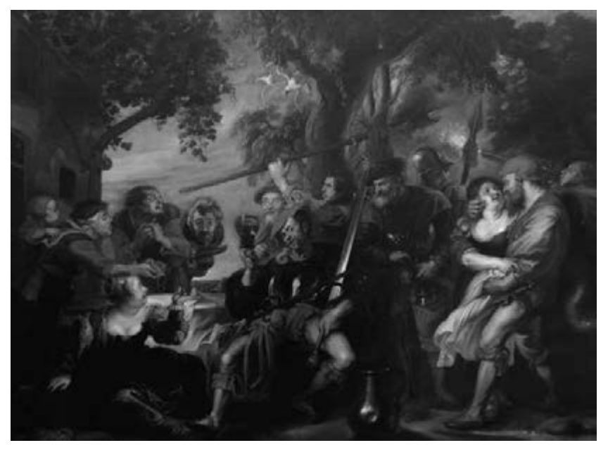
Figure 7.8 Peter Paul Rubens, Lansquenets Carousing ('The Marauders'), ca. 1637–40, canvas, 121.9 \times 163.2 cm, Switzerland, Private Collection.

the horror and misery inflicted on the peasants by the war accessible to a socially superior audience. The large number of copies and repetitions of Rubens' remarkable painting impressively attests to its contemporary popularity. ^{35}