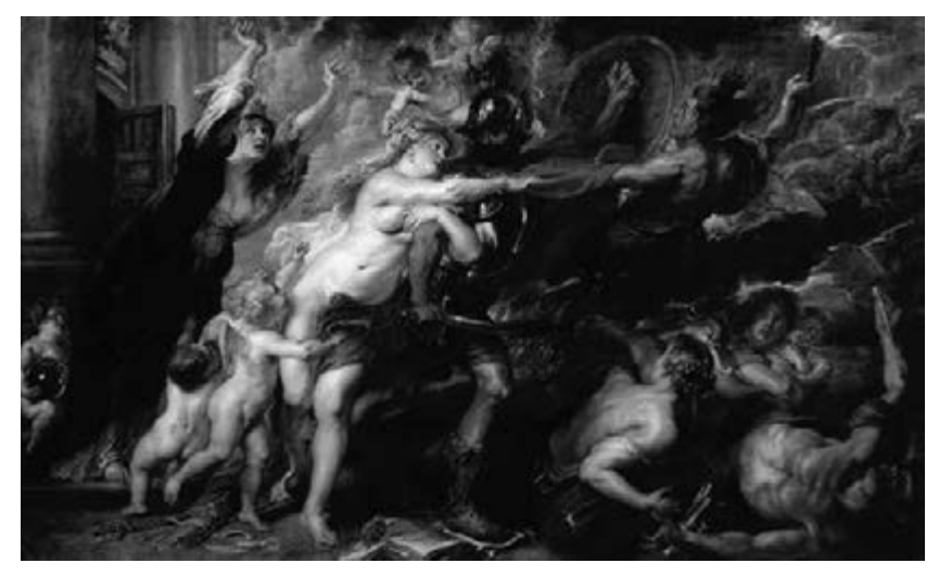
Figure 7.9 Peter Paul Rubens, Die Schrecken des Krieges , 1637/38, canvas, 206 × 345 cm, Florence, Palazzo Pitti. Galleria Palatina.

strives in vain to hold back Mars, the raging god of war. He is preceded by the terrifying furies, while a mother clasping her child in her arms embodies the virtue of charity as well as fertility and procreation. The female figure with the lute is clearly the embodiment of harmony, which is also expressed by the instrument assigned to her as an attribute. For Rubens, allegory is a figure of thought in which linguistic images and visualised concepts are interwoven. This is expressed most strikingly by the portrayal of Mars trampling on the sciences and fine arts, thus illustrating a concept that is already verbally a metaphor. Even before the painting reached Florence, the first copies must have been made, several of which ended up in the northern Netherlands. On 4 September 1651 Matthijs Musson delivered twelve paintings to a certain 'Monsieur Vinck' at a price of seventy guilders each, including one that, according to the brief description, showed the God of War with the Liberal Arts under his feet, 'Mars hebbende de vrij consten onder de voeten'. Sa