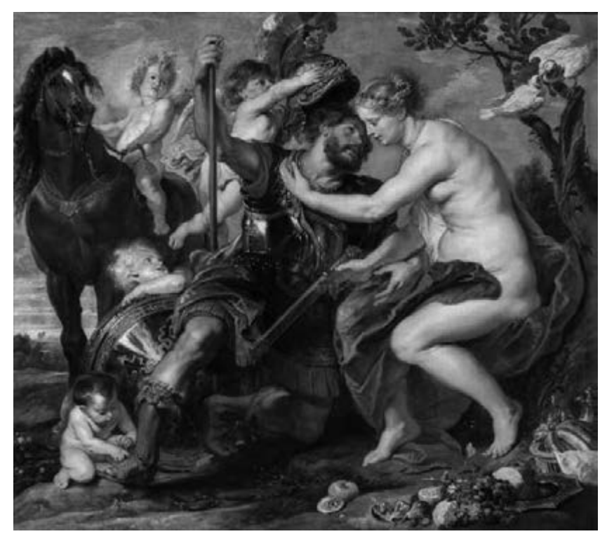
Figure 7.4 Peter Paul Rubens, Mars Disarmed by Venus , ca. 1615-17, canvas, 170 \times 193 cm, formerly Schloss Königsberg.

covered by a curtain, so as to protect 'innocent' eyes. Irrespective of what viewers may have felt about the sexually charged nature of the subject, they will also have easily understood its message as an allegory of peace, when Venus, the personification of love, succeeds in distracting Mars, the god of war, from pursuing his treacherous deeds. This allegorical imagery had already been used in the Dutch Republic to convey the joy felt at the conclusion of the twelve-year truce, though usually expressed though a visually different vocabulary. A fine example is Adriaen van de Venne's commemoration of the Truce of 1609 (Fig. 7.5), 14 showing an idyllic landscape in which love, this time personified by the god Cupid, leads a throng of people in contemporary dress past a pile of abandoned weapons.