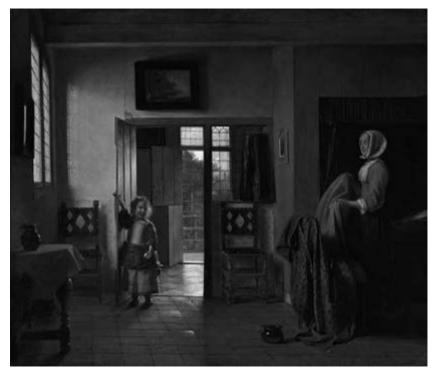
Figure 10.3 Pieter de Hooch, The Bedroom , 1658/60, canvas, 51 \times 60 cm, Washington, DC, National Gallery of Art, Widener Collection (Public Domain).

intrusiveness, and we could speculate as to whether the Dutch housewife of the seventeenth century experienced it any different from her husband. In the historical context of early modern (visual) culture, the gendering of interior and exterior, private and public space comes with the 'male gaze'—complacent or possessive, caring or desiring—being a security issue.