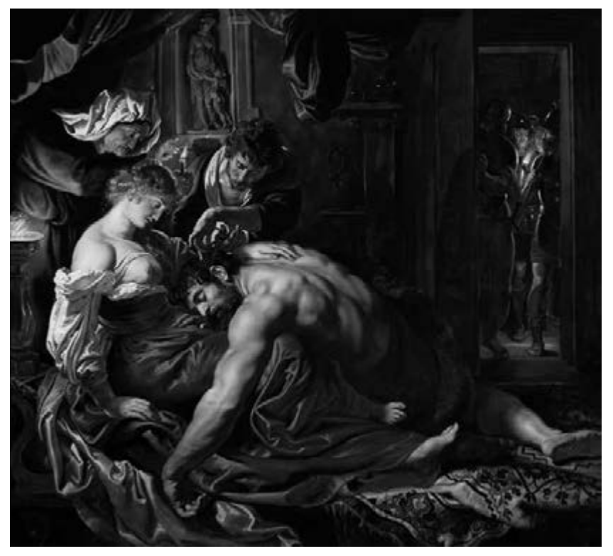
Figure 7.2 Peter Paul Rubens, Samson and Delilah, ca. 1609, panel, 185 \times 205 cm, London, National Gallery.