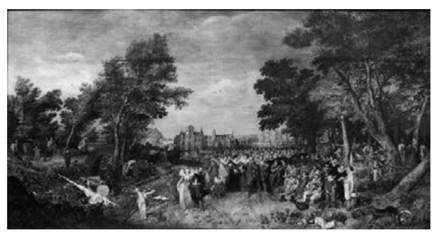
Figure 7.5 Adriaen van de Venne, Allegory of the Twelve Years' Truce , 1616, panel, 62 \times 113 cm, Paris, Museé du Louvre.

During the truce, Rubens also painted symbolic images of abundance for his Antwerp audience, which were reproduced in numerous workshop repetitions and sold extremely well.