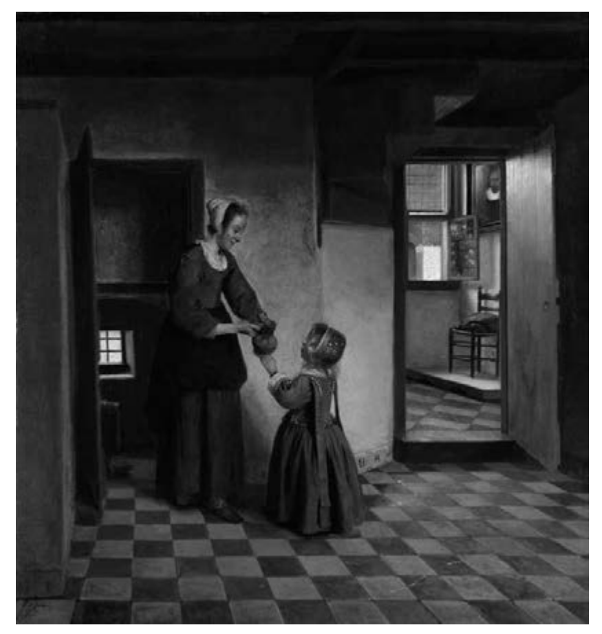
Figure 10.2 Pieter de Hooch, Woman with Child in a Pantry , ca. 1656–60, canvas, 65 \times 60.5 cm, Amsterdam, Rijksmuseum, Inv. Nr. SK-A-182 (Public Domain).

and security. Presenting domestic life in such a way seems to mark it as well as the act of beholding it as private. At the same time, and inevitably, the image robs them of this very privacy, exposing a fundamental vulnerability of privacy to illustration and visibility.