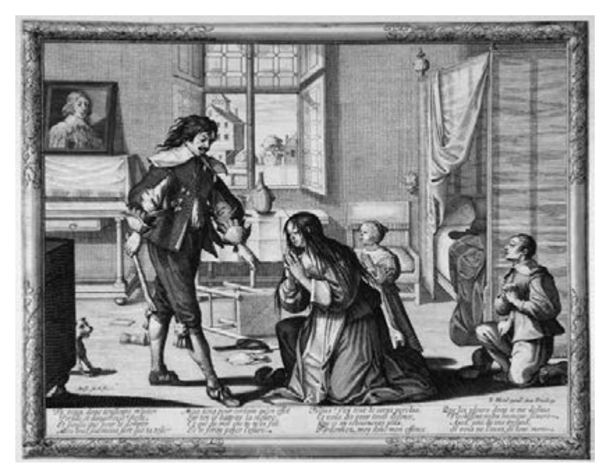
Figure 10.1 Abraham Bosse, Le mari battant sa femme (The husband hitting his wife), ca. 1633, engraving, 21 \times 30 cm / 25.8 \times 33.3 cm, New York, Metropolitan Museum of Art, Inv. Nr. 24.36.5 (Public Domain).

the social order as a whole. In both representations, the window in the background is wide open. Thus, the domestic scenes can be looked at (by the beholder) as well as overheard (by an imaginary neighbourhood). These scenes are ostentatiously made public because family discord is a problem that concerns everyone and must be collectively contained.<sup>8</sup>