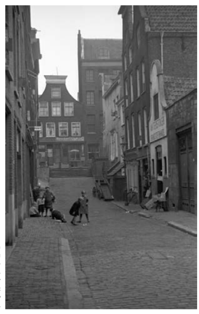
Figure 5.2 Photograph of the Zevenhuissteeg with the Schiedamsedijk in the background, presumably in 1937, by J.F.H. Roovers. Source: Romer, Passagieren op 'De Dijk', 40 / H.A. Voet.

regarding prostitution and other vice-ridden areas throughout the city centre. Through photographs, the writer tries to leave as little to the reader's imagination as possible, frequently emphasising the camera's usefulness to capture those men and women that make up Rotterdam's underbelly.<sup>33</sup>