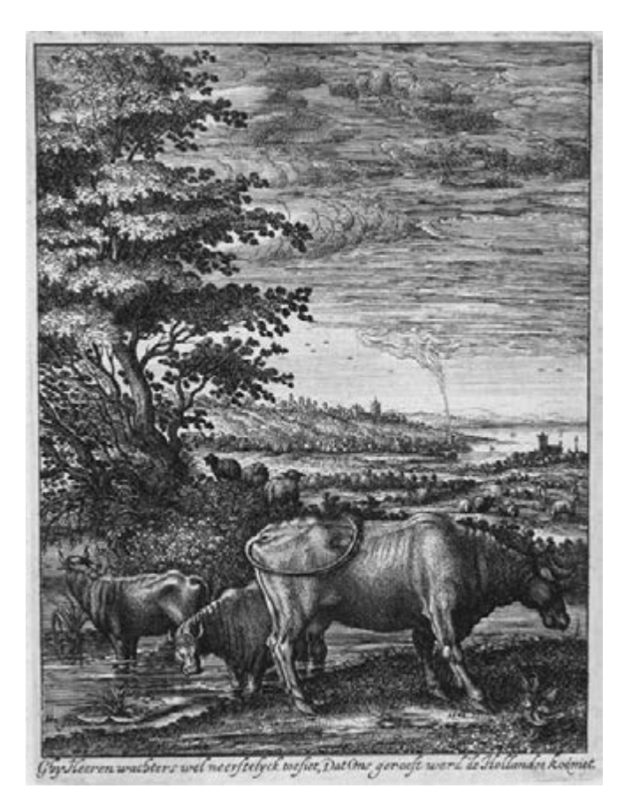
Figure 7.10 Hendrick Hondius, Cows in a Landscape, 1644, etching and engraving, 20.6 × 15.7 cm.

After the peace treaty of 1648, which Rubens was not to live to see, Amsterdam became the most important hub for trade in his paintings. Rubens' allegories, which imagined a golden age, also enjoyed great popularity in Holland. This may in part have been because this era, which in retrospect was praised as the 'Golden Age', was an auspiciously peaceful time. Even the double peace treaties of Münster and Osnabrück did not bring lasting peace to the now de jure-recognised Dutch Republic. In this respect, the unprecedentedly large number of idyllic landscapes produced in this era can be read as counter-images. For a close reading of the paintings produced in that period shows that the security that accompanies peace was and remained a dream for people at that time. Like the paintings by Rubens, the landscapes by Esaias van de Velde, Jan van Goyen or Salomon van Ruisdael can also be read allegorically. The windmills depicted in so many paintings thus appear as a symbol of the triumph of human ingenuity over nature. They are also a striking sign that the Dutch landscape in its