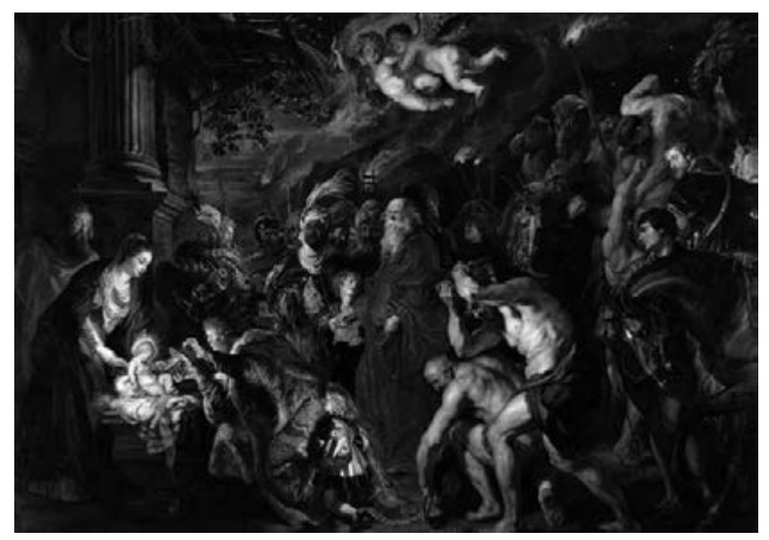
Figure 7.1 Peter Paul Rubens, Adoration of the Magi, 1609 (retouched 1628–29), canvas, 355.5 \times 493 cm, Madrid, Museo del Prado.