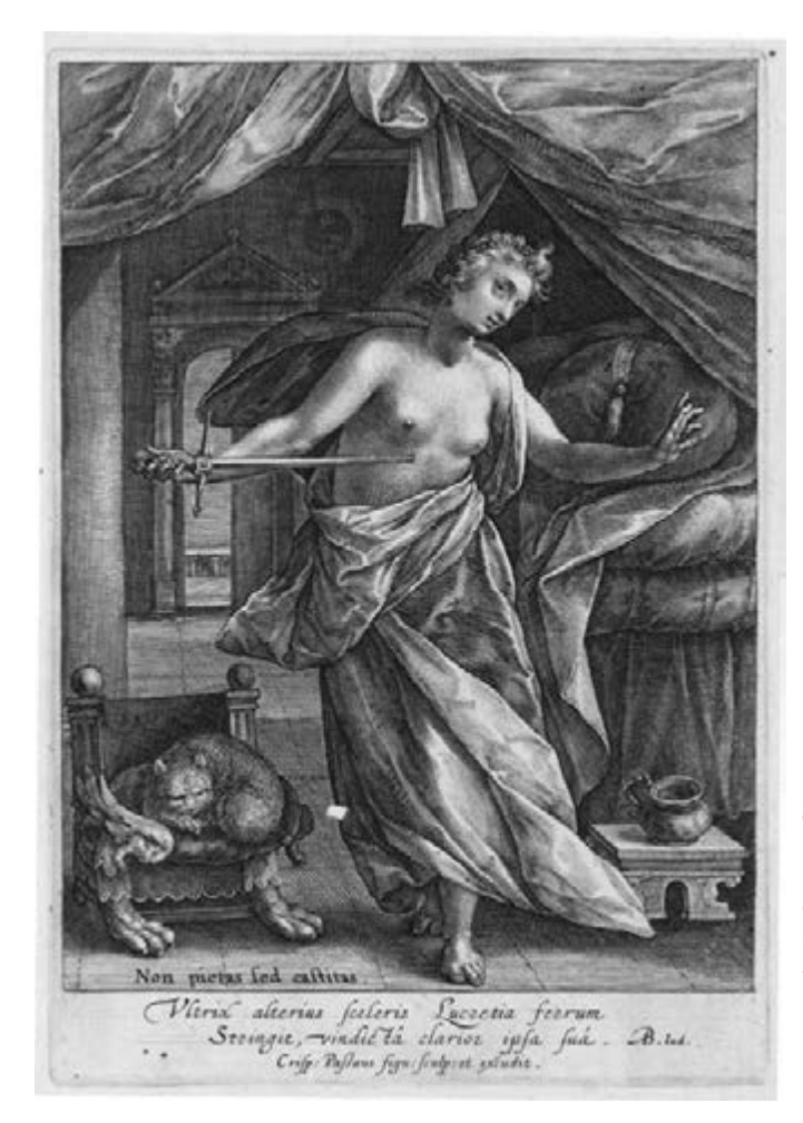
Figure 10.6 Crispijn van de Passe I, Lucretia , 1589/1611, engraving, 23.3 × 16.2 cm, Amsterdam, Rijksmuseum, Inv. Nr. RP-P-1986-284 (Public Domain).

The precarious situation painted by De Hooch recalls the ancient story of Lucretia, which had become very popular in the European Renaissance and the subject of many images. As told by Titus Livy, Ovid and other authors of classical antiquity and afterwards, Lucretia, a very beautiful and virtuous Roman woman, was raped by a relative in her own house. In consequence of this loss of honour, she took her own life with a dagger, and the events triggered an uprising of the people against the monarchy. An engraving by