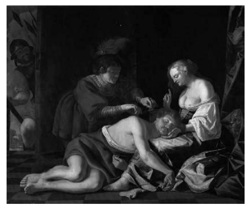
Figure 7.3 Christian von Couwenbergh, Samson und Delila, 1632, canvas, 156 \times 196 cm, Dordrecht, Dordrechts Museum.

the print by Matham as his model. This is a typical example of the close connections that existed between the northern and southern provinces of the Netherlands.