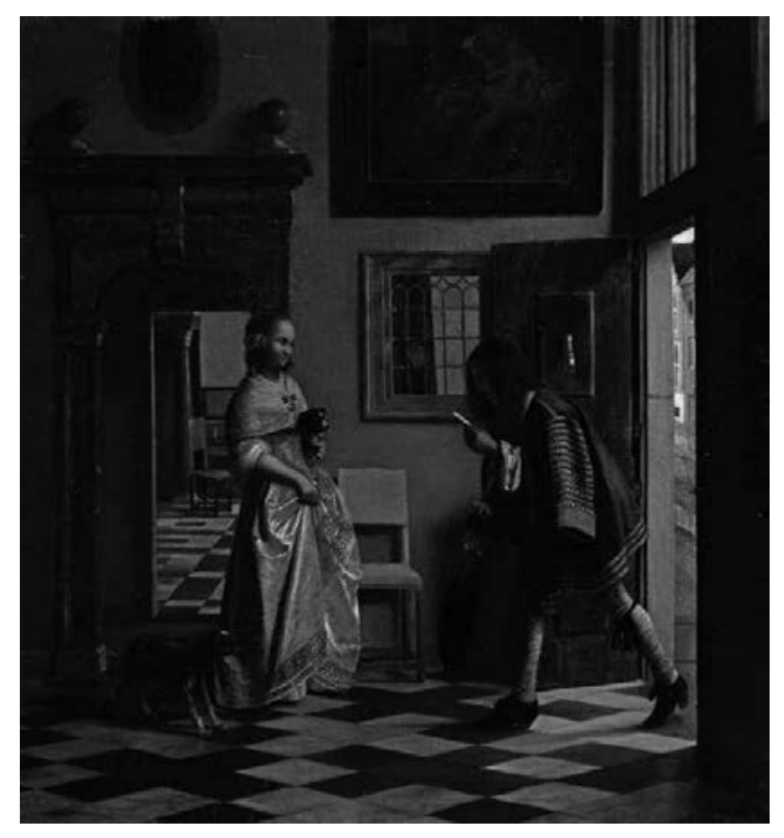
Figure 10.4 Pieter de Hooch, The Messenger of Love , ca. 1670, canvas, 57 \times 53 cm, Hamburg, Kunsthalle, Inv. Nr. HK-184.

the painting infers. It is concomitantly due to the sheer fact that De Hooch depicted the casual encounter of a man and a woman on the threshold between the domestic interior and the public sphere, that is, between the female household and its male dominated environs. The messenger might be harmless, but he remains a doubtful intruder nonetheless; maybe he brings love, which is exactly why danger could be imminent. The 'dialogic' quality of the painting, which according to David R. Smith lies at the heart of the realism in seventeenth-century Dutch genre painting, also makes for its ambivalence. For, having easy access to a casual scene which may please and entertain him, the beholder also becomes aware of the fact that the domestic space can never be completely safe in the sense of being shielded from and impenetrable to the outside world. Men might seek