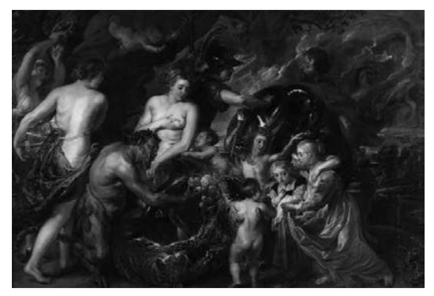
Figure 7.6 Peter Paul Rubens, Minerva Protects Pax from Mars (Allegory on the Blessings of Peace) , 1629-30, canvas, 203.5 \times 298 cm, London, National Gallery.

pictorial conceit at the time, which through a combination of text and image opened up ever new possibilities of interpretation, Rubens' picture left it to the respective viewer to draw his or her conclusions as to its meaning. When considered in the context of the concrete political situation, numerous interpretations could indeed be drawn—especially since the meaning of some figures is not entirely clear. But ultimately, all possible interpretations of Rubens' allusive allegory were aimed at illustrating the happy consequences of peace. It is therefore surely no coincidence that on his peace mission to London he also created another picture of Mars and Venus, varying the motif of the painting he had created for the Dutch court. 19