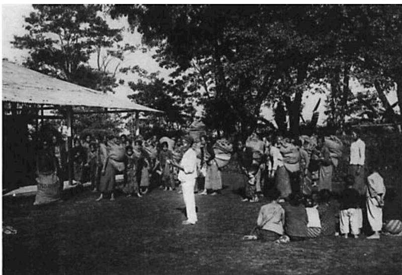
Bringing in the coffee at the Pidji Ombo estate, Kediri, no year.

With regard to incomes, the figures were not entirely complete or reliable. The unreliability applied particularly to families living off the premises. 57 Nor was it possible to determine the true contribution of women to the family income. Only the wages earned on the estate were categorised according to the position of the earner within the family (head of the family, wife of head of the