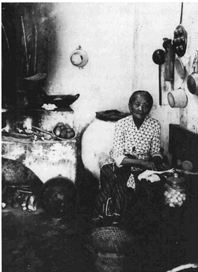
Kokki in her kitchen, no year ( KITLV , Leiden),

Next to their tasks of educating responsible citizens and maintaining colonial prestige within their households, it was this larger framework of social mothering that incorporated white women into the realm of colonial domination. It enlisted them in the Ethical colonial project and diminished the boundaries between the home and (colonial/Indonesian) society at large. To European women servants were the primary representatives of this society. The Colonial School's official ideology suggested that the task of white women was broader and nobler than being enclosed in the house. It might even convert the housewife's role into an attractive occupation, providing her with an honourable social purpose to live for. In this discourse we find again a familial rhetoric, in