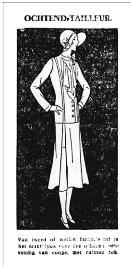
A woolencoat and skirt , Java-Bode . July n, 1930.

Fashion reports in the women's pages of the daily newspapers were selections of what was considered to be of interest to women in the colony. The reports embodied the characteristics of fashion so aptly described by Barthes in the 1950S; timeless, placeless fashion pages represented female readers and their dreams: women without sorrows or problems, beaming and beautiful, banishing 'anything aesthetically or morally displeasing':