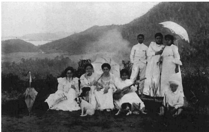
A group of Indo-Europeans, women in bébé -dresses at an outing, 1910

was completely 'out', 35 Even as early as around 1900 their popularity was not uncontested, as they had to compete with simple, straight, and plain, so-called 'reform clothing' and bébé dresses: wide, white, shapeless, and long-sleeved, with frills and ruches. The bébé dresses had a short life. In the 1910s, women of the higher classes frowned upon this frumpy 'provincial' outfit. t By the 1920s, bébé dresses were considered 'uglier than decently embroidered night-gowns, which immediately got wrinkled and were difficult to iron'. 37