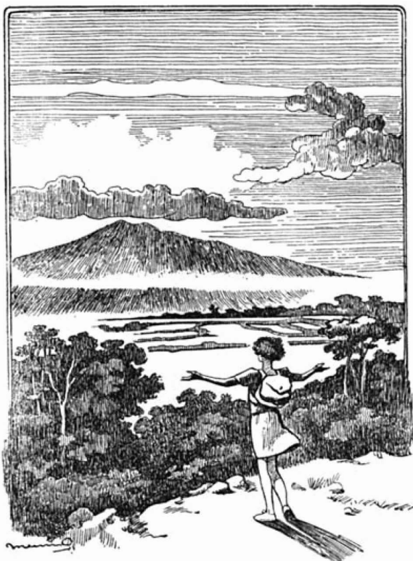
„Ik bee toch hier geboren. Ik houd van de ber en en van de mensen hier!”

'I am born here. I love the mountains and the people here.' Illustration from Ams houdt van Indie (1941).