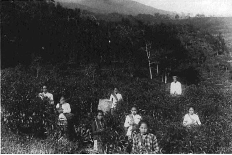
Harvesting tea at the Selokaton estate, Kendal, no year.

Coolie Budget Survey confirmed these figures except for the tobacco and sugar estates. In this respect, it turned out that the estates in the survey were not representative. However, of all labourers between ages 16 and 61, 40 percent were women, who mostly came from families of garden and factory workers. In these categories, estates made use of both male and female labour, and women took the opportunity to work. However, their labour hours were less than that of the men: of all hours spent in gardens and factories by men and women, women did not account for 40 percent, but for slightly more than a quarter, 27 percent and 29 percent respectively. Women in top positions of any significance were found only on the coffee estates, where women accounted for 20 percent of all hours spent at that level.