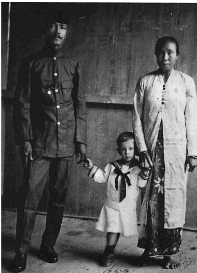
Dutch boy with babu and male servant (the driver?), ea. 1910 (KIT, Amsterdam).

trial organisations in japan.?? In the case of modern Indonesia, we may conclude that - even if the Suharto political rhetoric of the family did not have its roots in colonial 'familisation' - it was strongly reinforced by the language and ideology of Western colonialism.